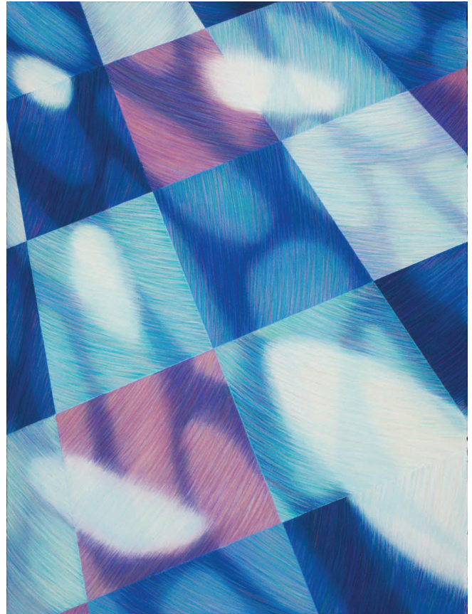
Cultural Quilt Pastel on paper 80h x 60w cm 2006